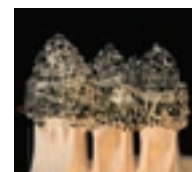
● Above centre and above: Casa Mila; above right: Antoni Gaudi bust; other images: traditional Spanish dancing.

A short walk took the delegates to the dinner venue, where they were served tapas and a brilliant display of traditional Spanish dancing that had the whole audience holding its communal breath as the artists lifted their performances in crescendo towards a frantic finale. It was almost as exhausting for the audience and the dancers. Great night!