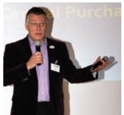
strategic partners addressed the meeting: AS24 and Rhenus Office Systems (see separate panels).

As always the EUROMOVERS conference ended with presentations to the star performers within the group in terms of tonnage through the network and quality of service.